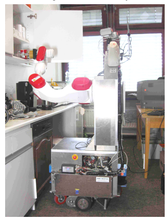
Fig. 1 TASER executing a manipulation task

necessary unknown information, generating queries about this information, and submitting these queries to external knowledge sources. One major knowledge